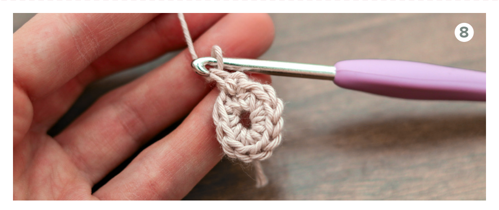
Round 3 Hdc20. SI in the 1st hdc. (images 9, 10)