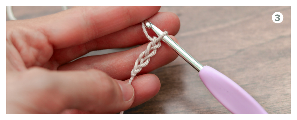
To make a magic ring sl in the 1st st.