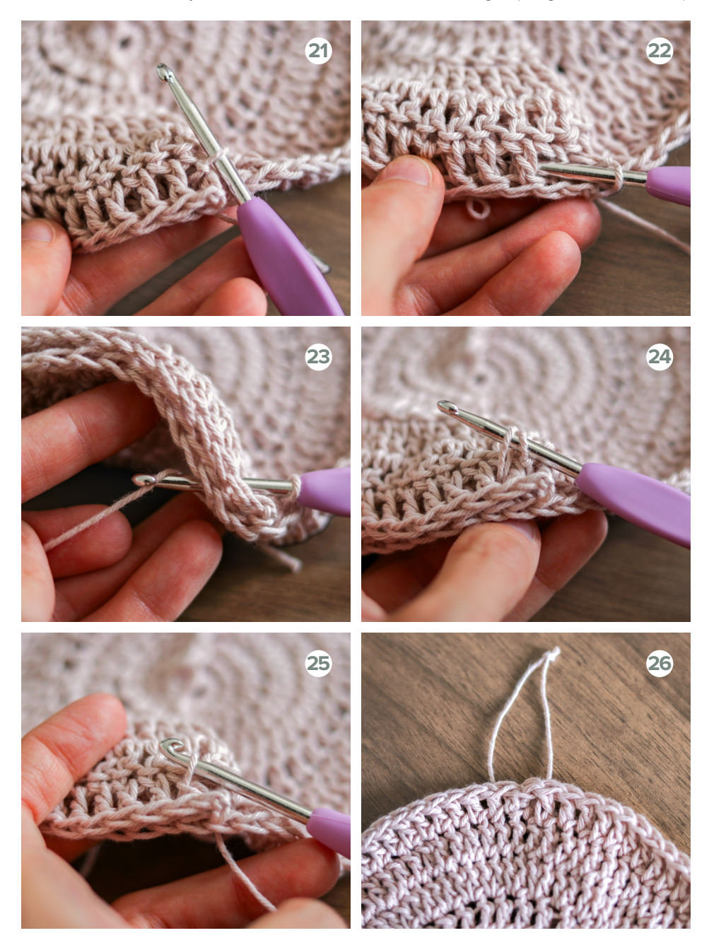
Put a small piece of yarn on top as the hanger, and now you're done! (image 26)

*Insert the hook below the next dc (front side and background), grab the yarn, and make a sl. Continue * this till you attach the front side of the wall hanger. (images 22, 23, 24, 25)