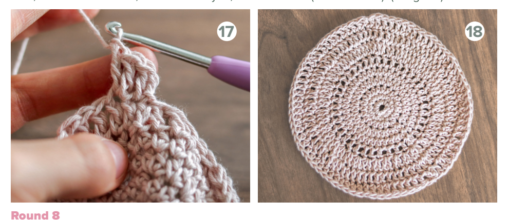
Ch2 (counts as the 1st dc), dc79, sl in the 1st st (80dc in total).