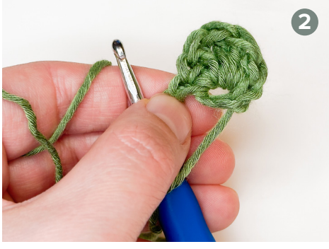
Step 2 Sc1, hdc1, dc1, tr1, dc1, hdc1, sc1 – all into the circle.