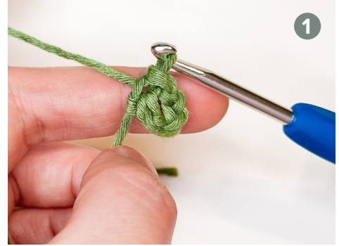
Step 1 SI st into the 1st st to form a circle.