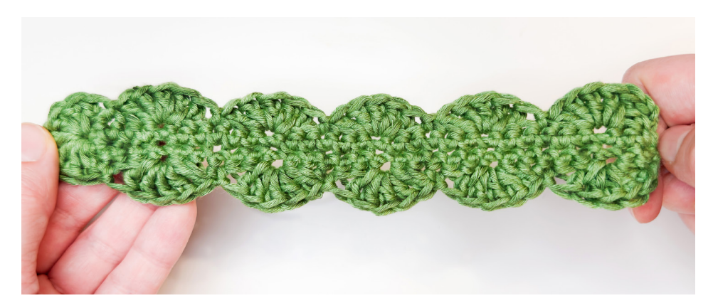
You may make a tassel and attach it to the bookmark.

Sk2 st, dc5 in the 3rd st, sk2, sl in the 3rd st. Sk2 st, dc5 in the 3rd st, sk2, sl in the 3rd st. Sk2 st, dc5 in the 3rd st, sk2, sl in the 3rd st. Sk2 st, dc5 in the 3rd st, sk2, sl in the 3rd st. Sk1, dc7 in the 2nd st, sk1, sl in the 2nd st. Sk2 st, dc5 in the 3rd st, sk2, sl in the 3rd st. Sk2 st, dc5 in the 3rd st, sk2, sl in the 3rd st. Sk2 st, dc5 in the 3rd st, sk2, sl in the 3rd st. Sk1, dc7 in the 2nd st, sk1, sl in the 2nd st. Sk2 st, dc5 in the 3rd st, sk2, sl in the 3rd st. Sk2 st, dc5 in the 3rd st, sk2, sl in the 3rd st. Sk2 st, dc5 in the 3rd st, sk2, sl in the 3rd st. Sk2 st, dc5 in the 3rd st, sk2, sl in the 3rd st. Sk2 st, dc5 in the 3rd st, sk2, sl in the 3rd st. Sk2 st, dc5 in the 3rd st, sk2, sl in the last st. Sk2 st, dc5 in the 3rd st, sk2, sl in the last st. Cut the yarn and weave in the ends.