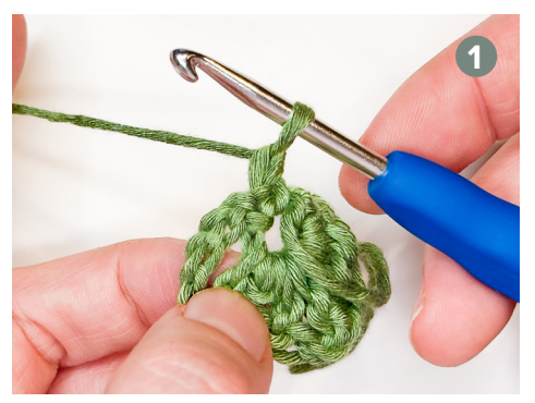
Step 1 *Turn the project, ch1.