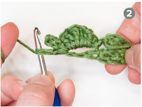
Step 2 Sc1, hdc1, dc1, tr1, dc1, hdc1, sc1, ch5, sl st.